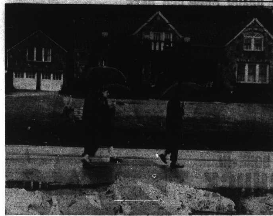
THREE CO-EDS WITH UMBRELLAS stroll along the Blowing Rock Road.