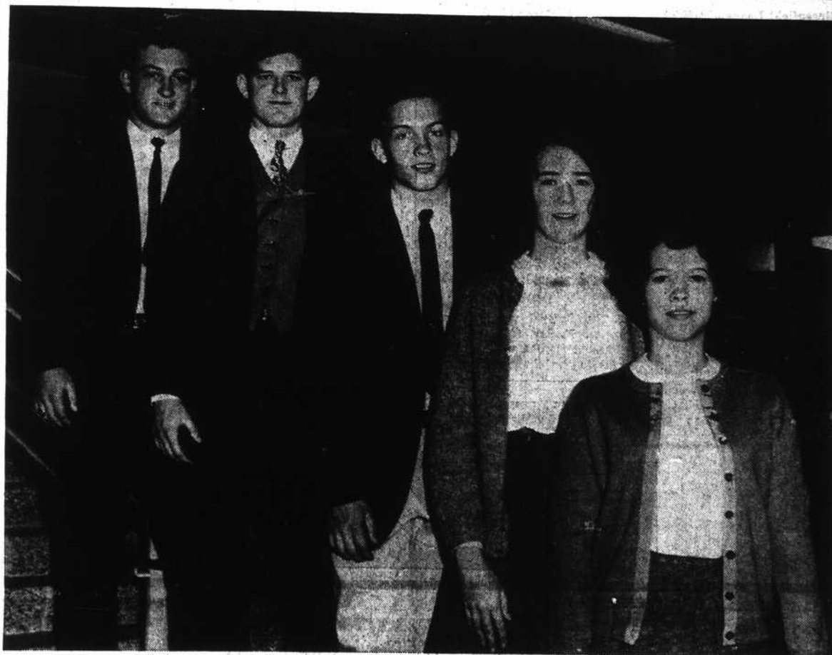
Students Give $50 To Charity

After the recent basketball game between Hickory High School and Watauga High School, students attended a sock-hop at Watauga, and funds from the dance were presented to the Watauga chapter of March of Dimes. Fifty dollars was given on behalf of the student body. Student Council members who organized the money-raising event are (from right): Miss