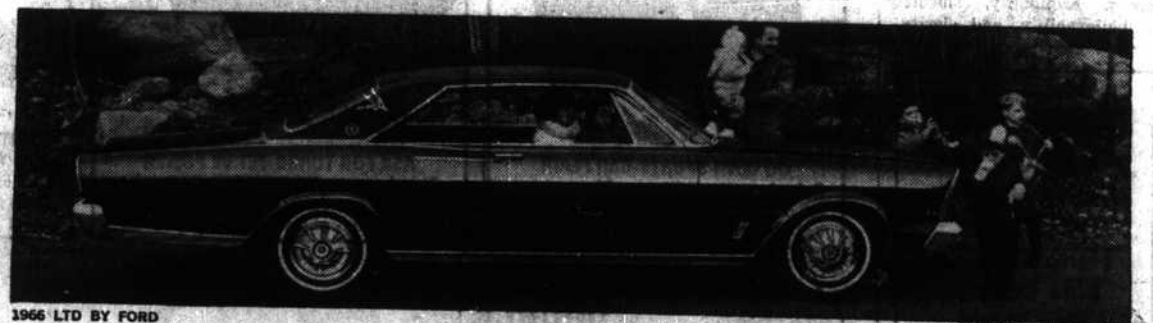
1966 LTD BY FORD

Our '66 Ford has one of the world's quietest rides... the strongest Ford body ever... a new-concept frame... and a unique suspension designed to take the thumps out of bumps. (With our family the quiet doesn't mean much. But it's nice to know the quality's there.)