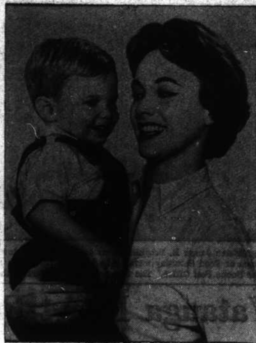
(Plus 50c Mailing, Handling, Ins. Fee)