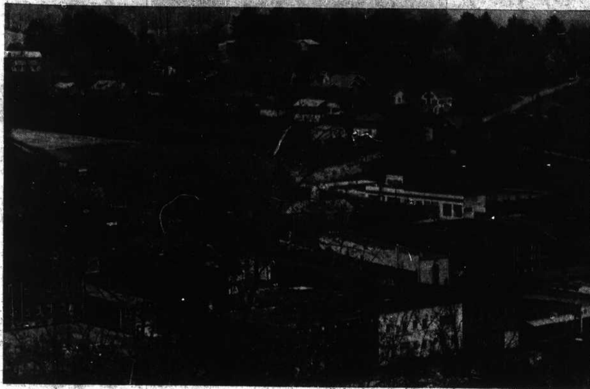
THIS LOFTY VIEW OF THE TOWN OF BOONE shows most of the business section. The building in the lower left-hand corner is the Democrat office, and the residences on the hill opposite are on Grand Boulevard. Most of Depot Street and portions

of both West and East King Street are seen here. The bare space in the upper left-hand portion of the picture is the city parking lot facing Queen Street.