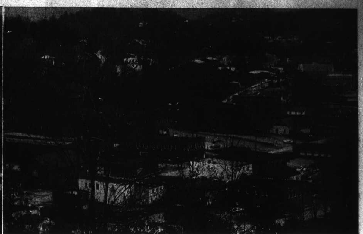
The building in the lower left-hand portion here is the old City Hall structure. The Daniel Boone Hotel is seen partially about an inch higher. The long building about center is the

of both West and East King Street are seen here. The bare space in the upper left-hand portion of the picture is the city parking lot facing Queen Street.