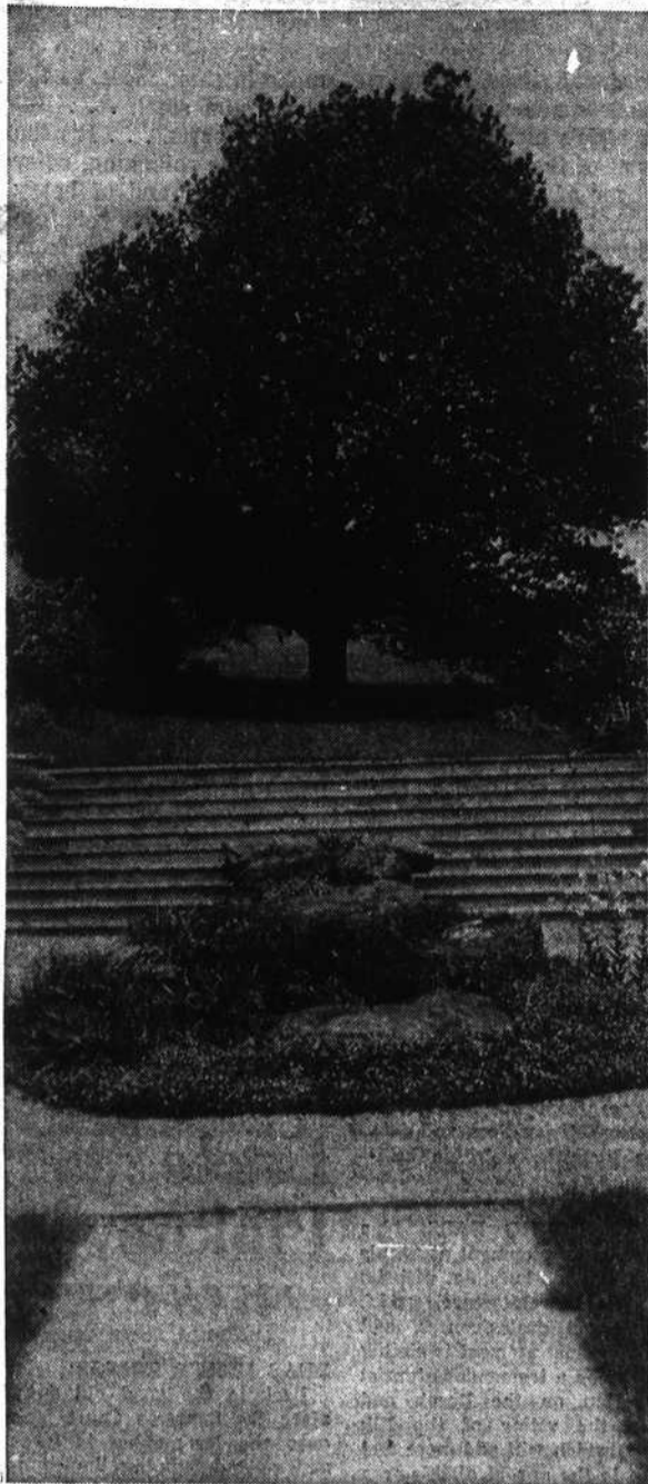
THE DANIEL BOONE BOTANICAL GARDENS, adjacent to the Daniel Boone Amphitheater, soon will be open to the public, and a great deal already has been done toward readying the grounds for the enjoyment of thousands who visit it each year.