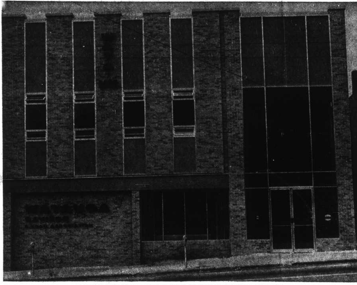
LOCAL FINANCIAL INSTITUTION OCCUPIES IMPOSING EDIFICE.

BOONE, WATAUGA COUNTY, NORTH CAROLINA, THURSDAY, JULY 14, 1966