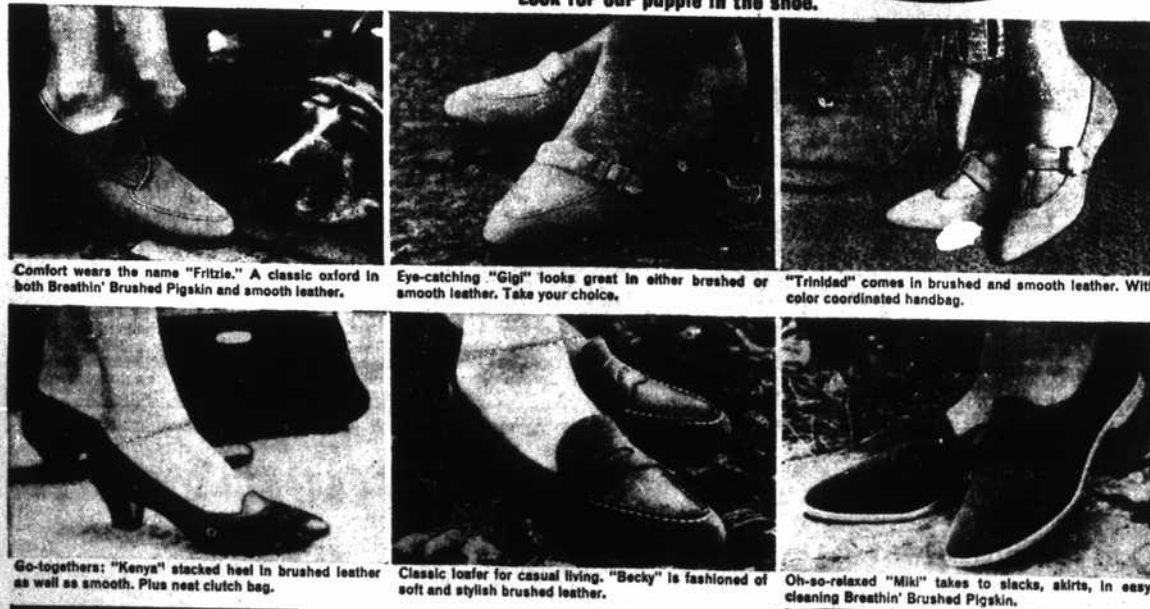
Comfort wears the name "Fritz." A classic oxford in both Breathin' Brushed Pigskin and smooth leather.