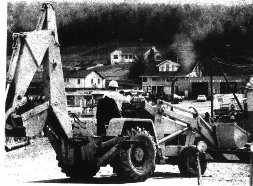
HEAVY MACHINERY IN PERKINSVILLE—Work on Boone's $1,860,000 water-sewer project is underway in Perksville, which was annexed with two other outlying districts when the city voted the bonds. Flagmen are

On Pilot Schooling Secretary of Defense Robert S. McNamara has been asked to make up a huge boost in Army pilot training.