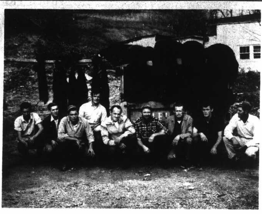
Big Bear Hunt

If the program becomes a reality, one of the main problems will be indigent patients: "So many people in the area can't pay for treatment."