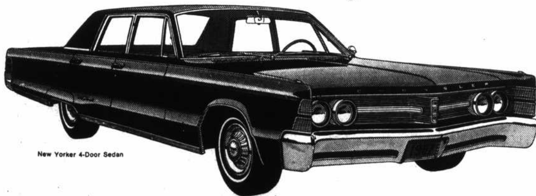
New Yorker 4-Door Sedan

Moving up is catching on at your Take Charge dealer's