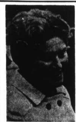
Svetlana Alliluyeva... the only daughter of Stalin and his last surviving child... fled to America in April.

She came, she said, to "seek the self expression that has been denied me for so long in Russia."