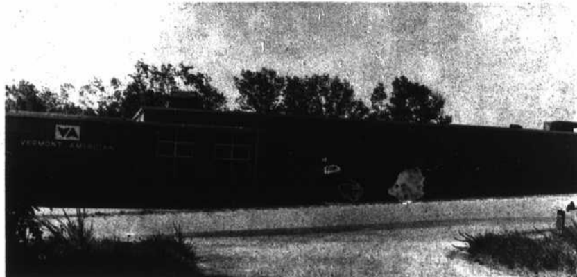
VERMONT AMERICAN CORPORATION