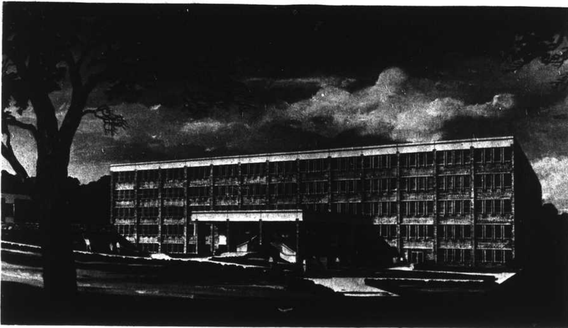
ARCHITECT'S DRAWING OF NEW UNIVERSITY BUILDING