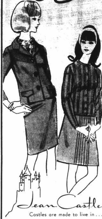
Castles are made to live in...