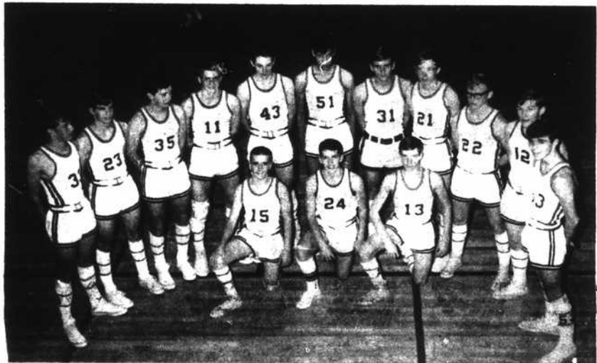
THE W. H. S. JUNIOR VARSITY