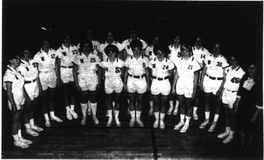
THE GIRLS' TEAM