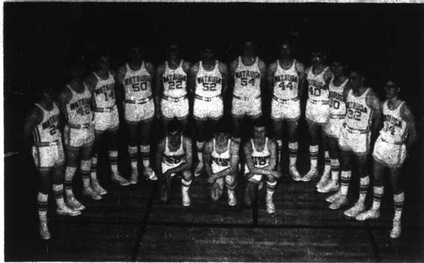
WATAUGA HIGH SCHOOL'S VARSITY TEAM