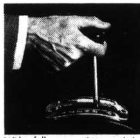
With a fully automatic transmission.

If you bet a friend we never would, we almost didn't.