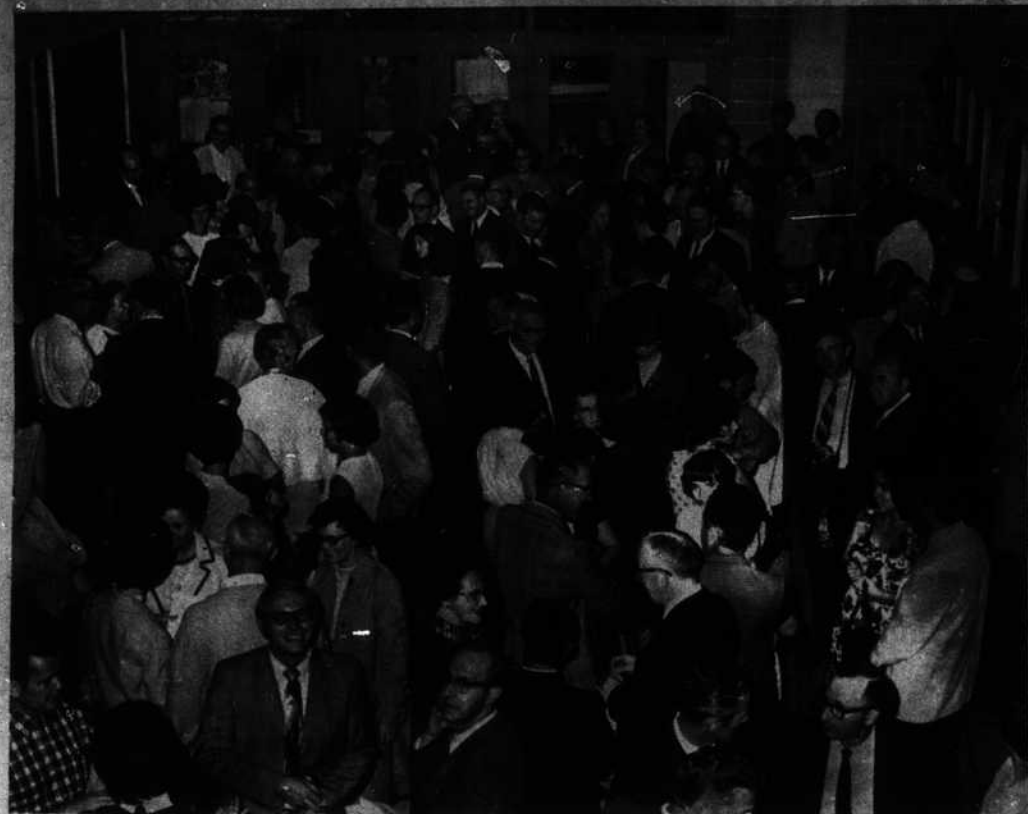
This is a small section of the crowd attending the Thursday night chicken barbecue dinner on the Appalachian campus.