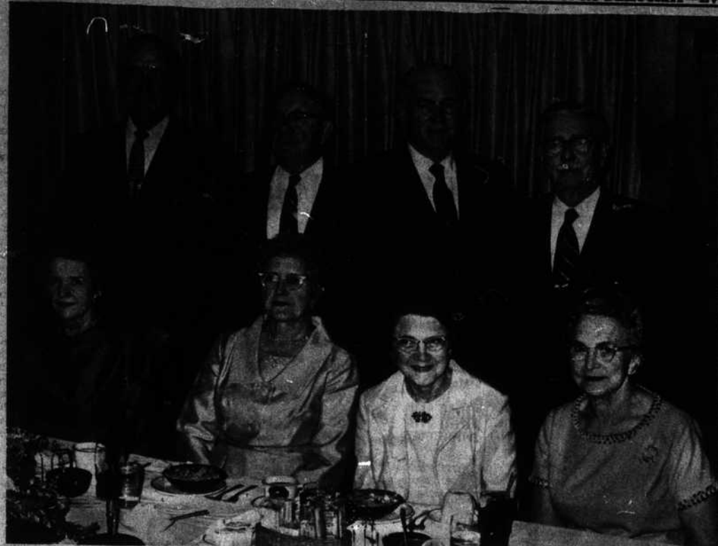
CLASS OF 1916, APPALACHIAN TRAINING SCHOOL.—The members of Appalachian's graduating class of 1916 may go down on the records as being one of the most gregarious groups in the history of the university. They met for the "first time in a long time" in 1966, their 50th anniversary. But the classmates enjoyed their get-together so much that they have been meeting yearly ever since. Assembled last month at homecoming, they