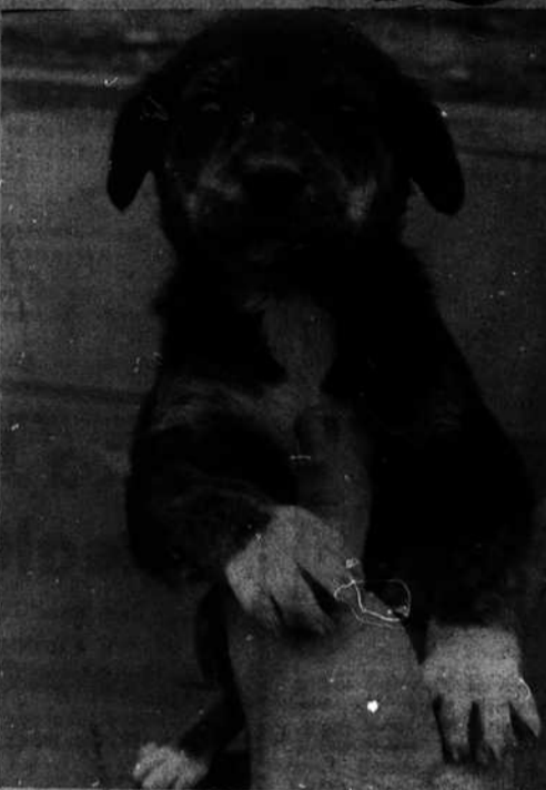
This Fellow Needs A Warm Home

The pet adoption service of the Humane Society of Watauga County, The pet shelter is located adjacent to the Boone sewerage disposal plant. Visit us any day.