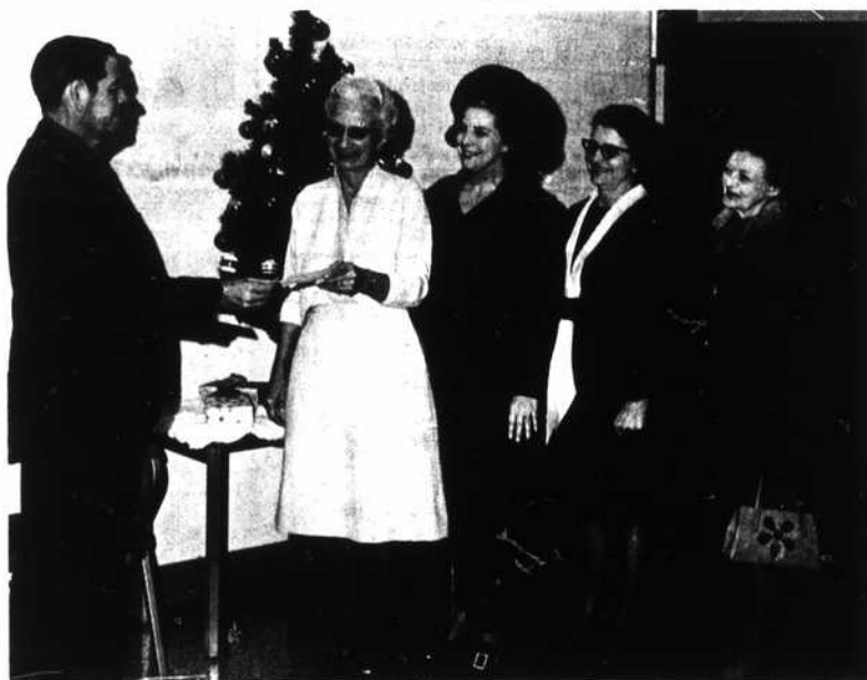
Win Christmas Decorations Contest