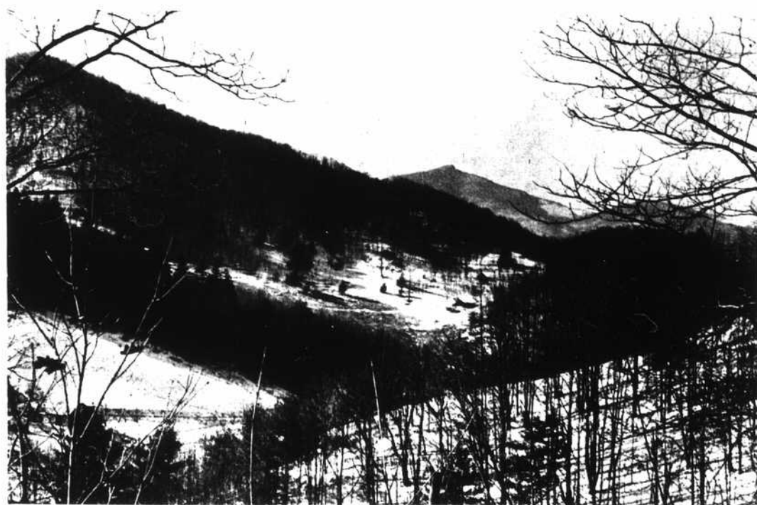
Watauga County: Christmas Week, 1970