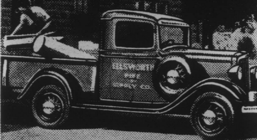
Half-Ton Pick-Up, $465 (112 Wheelbase)