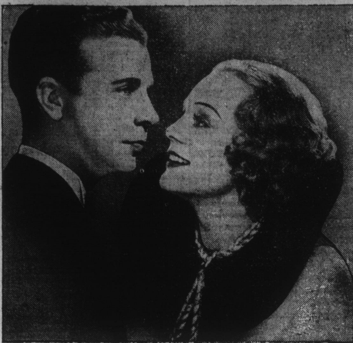
Gloria Stuart, judging by appearances, feels the same way about Dick Powell as the rest of America does. Incidentally, the two youngsters make one of the most lovable star teams you've ever seen in the movies. They're in "Gold Diggers of 1935" at the Taylor Theatre, Edenton, today (Thursday) and Friday.