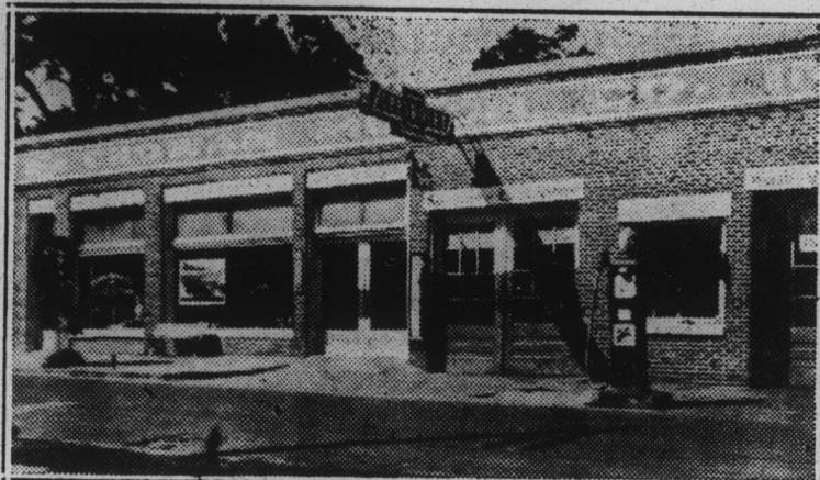
CHOWAN MOTOR COMPANY