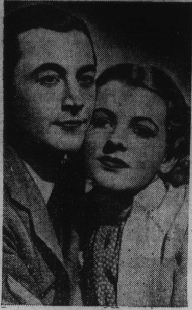
Robert Young and Betty Furness in "Calm Yourself" which is the special Wednesday attraction at the Taylor Theatre, Edenton, on October 2.