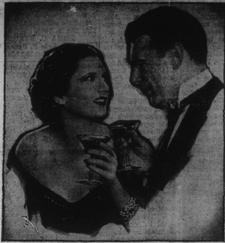
Kay Francis and George Brent, co-starred in the picture "The Goose and the Gander," which will be shown at the Taylor Theatre, Edenton, Monday and Tuesday, October 28 and 29. Both stars are very popular and in this vehicle will draw large crowds.