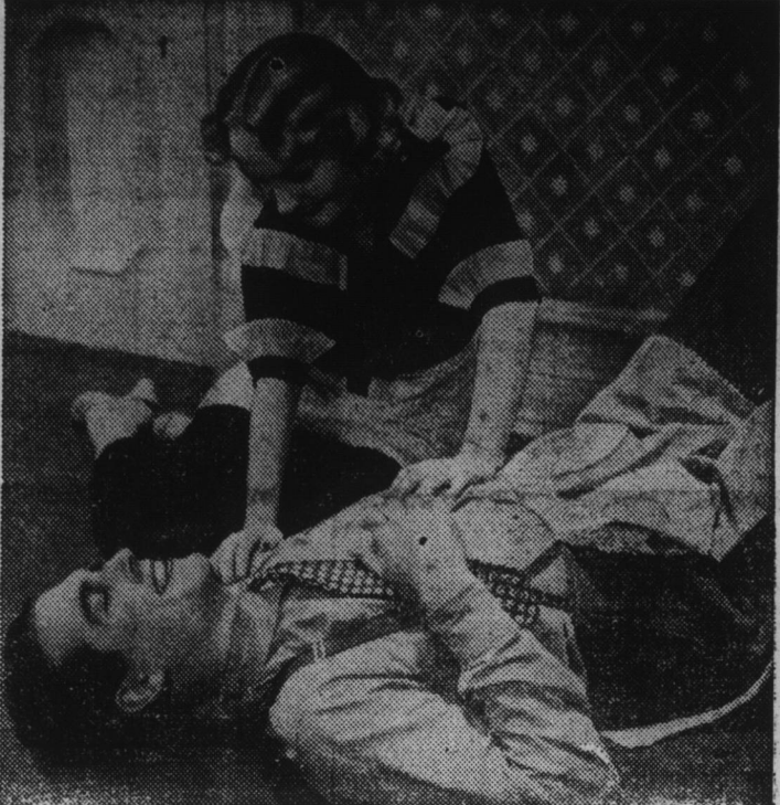
One of the many laugh provoking moments in Paramount's hilarious "Hands Across the Table," showing at the Taylor Theatre today and Friday, featuring Carole Lombard and Fred MacMurray.