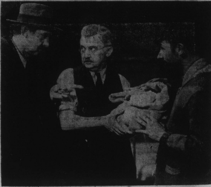
It happened in Canada! Five darling babies born at once, and this scene from "The Country Doctor," which stars the Dionne quintuplets, shows Slim Summerville, Jean Hersholt and John Qualen more than a little amazed at the stork's deposit. The picture will be seen in the Taylor Theatre, Edenton today (Thursday) and Friday.