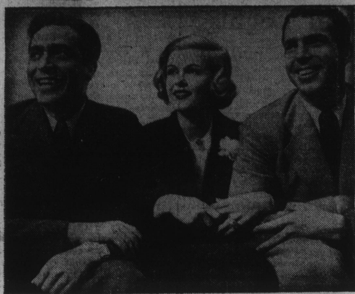
Joan Bennett's cornered by Fred MacMurray and John Howard, in this scene from "Thirteen Hours By Air," which is the feature picture at the Taylor Theatre today (Thursday), but from the enthusiastic grip she has on both men's arms, it doesn't seem to be bothering her!