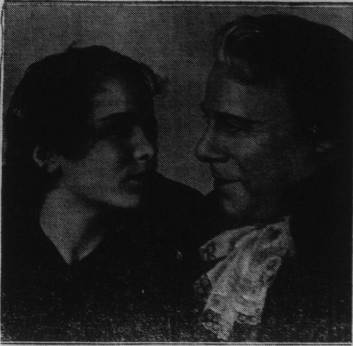
The strange meeting of a grandfather and his child is thrillingly portrayed by Edmund Gwenn, beloved actor of the British stage and Billy Mauch, young radio star in "Anthony Adverse," which will be screened at the Taylor Theatre, Edenton, Monday and Tuesday.