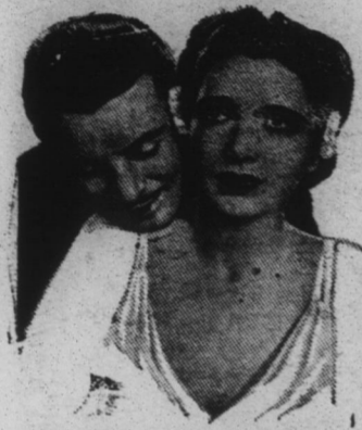
Kay Scales the Heights of True Greatness... In This Daring Drama That Crashes the Forbidden Frontiers of a Woman's Heart!

KAY FRANCIS "GIVE ME YOUR HEART" GEORGE BRENT Act News