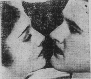
HISTORY'S MOST HEROIC DEED IMMORTALIZED BY THE GALLANT LOVERS OF "CAPTAIN BLOOD"!

ERROL FLYNN OLIVIA De HAVILLAND The CHARGE of the LIGHT BRIGADE