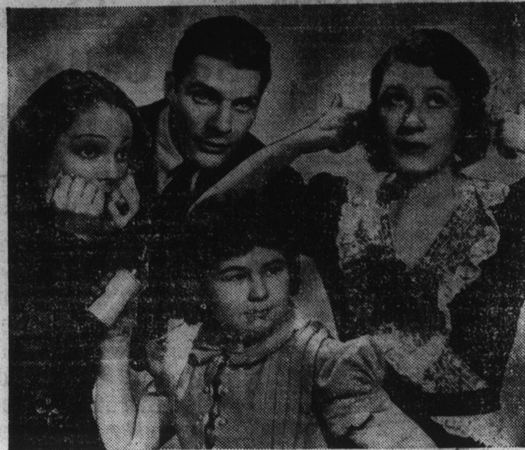
Off on her rip-roaring rampage is Jane Withers (center), the harum-scarum half-pint of dynamite. Her apprehensive friends are (left to right) Sally Blane, Robert Kent and Joan Davis, in "Angel's Holiday," at the Taylor Theatre, Edenton, today (Thursday) only.