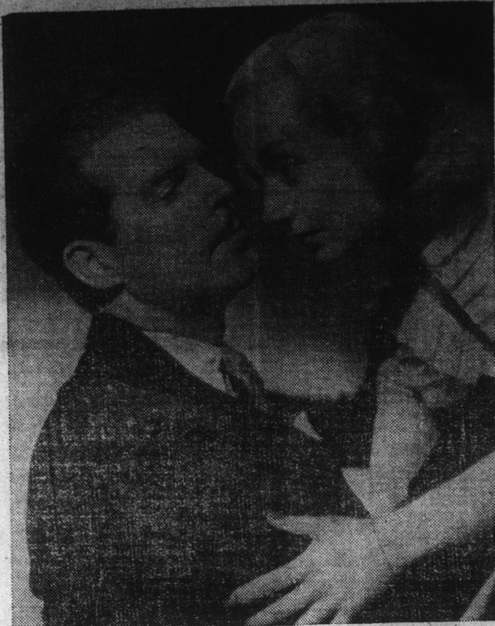
Carole Lombard and Fred MacMurray are teamed together again in "True Confession," new comedy-drama which will be featured at the Taylor Theatre, Edenton, Friday, with John Barrymore co-starred with them.