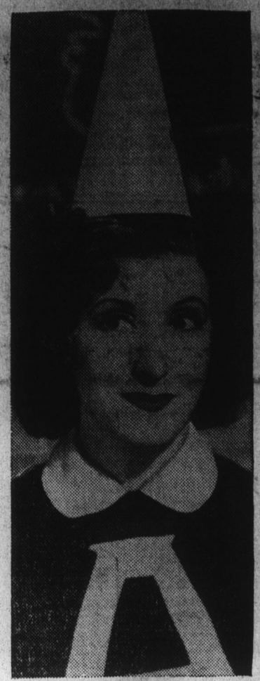
Gracie Allen swings from dunc to dean and then back to dunc again in "College Swing," coming to the Taylor Theatre, Edenton, Monday.