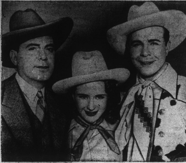
Pat O'Brien, Priscilla Lane and Dick Powell head the cast of "Cowboy from Brooklyn," hilarious new musical comedy at the Taylor Theatre, Edenton, today (Thursday) and Friday.