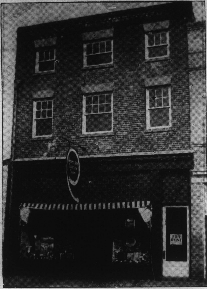
The house of a thousand parts—practically every serviceable automobile accessory may be obtained at this modern automobile supply store, an associated unit of the great Western Auto Supply house of Kansas City. Locally owned and operated.