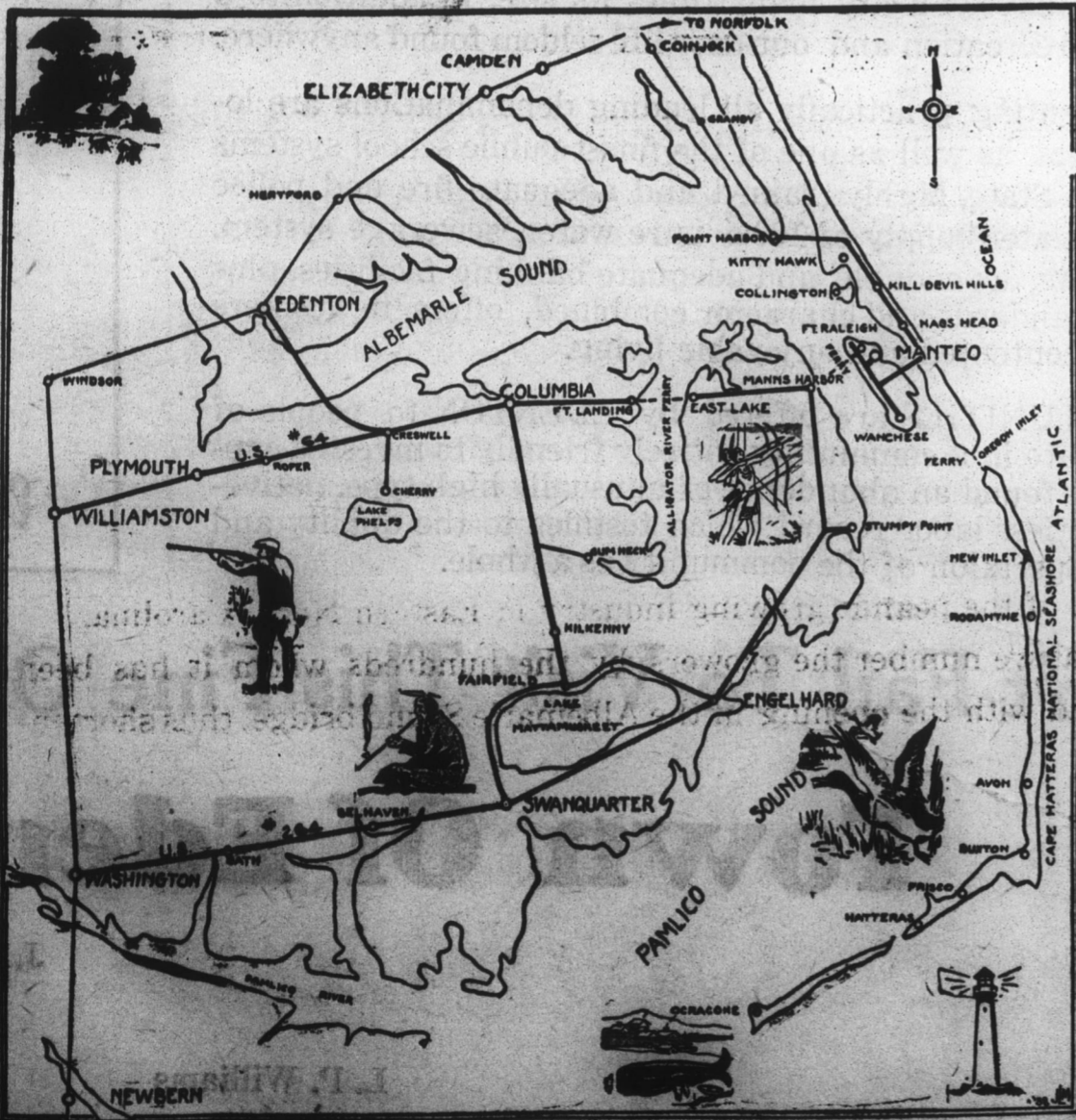
The above map showing the highway system of the Albemarle section of North Carolina showing the new highway from Edenton to Creswell, connecting U. S. 17 from north to south with U. S. 64 from east to west, crossing the three and one-half mile new Albemarle Sound bridge, cutting the distance between these two points approximately 70 miles.