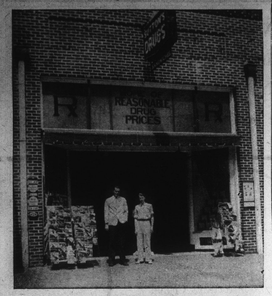
Sutton's Drug Store, located on South Broad Street, is modern throughout, offering a fine collection of drugs, sundries, magazines, candies and maintaining an up-to-date soda fountain service.