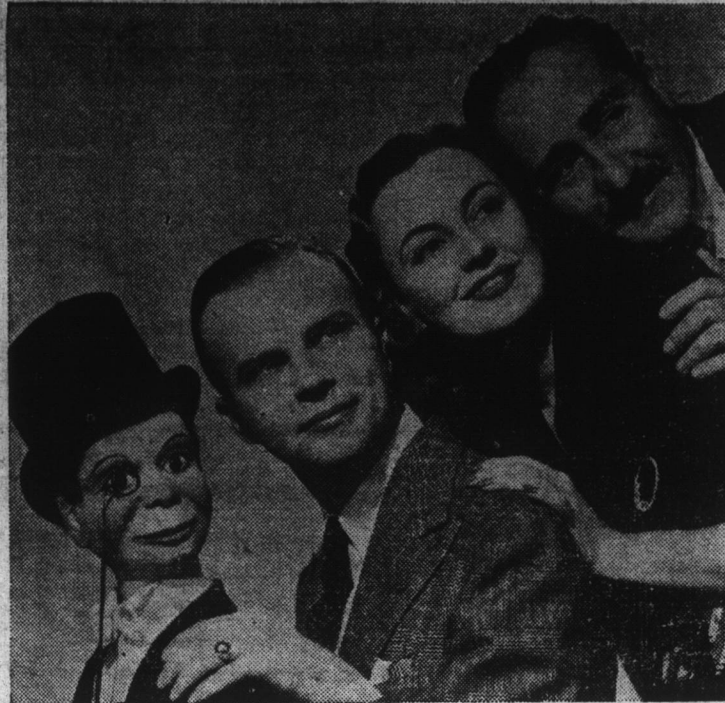
Charlie McCarthy, Edgar Bergen, Andrea Leeds and Adolphe Menjou all featured in John M. Stahl's production, "Letter of Introduction" at the Taylor Theatre, Edenton, Monday and Tuesday. This picture is included in the movie quiz in which many prizes will be awarded.