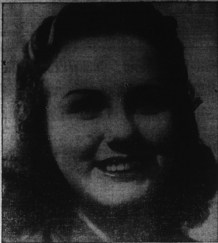
Deanna Durbin as she appears in "That Certain Age," showing at the Taylor Theatre, Edenton today (Thursday) and Friday.