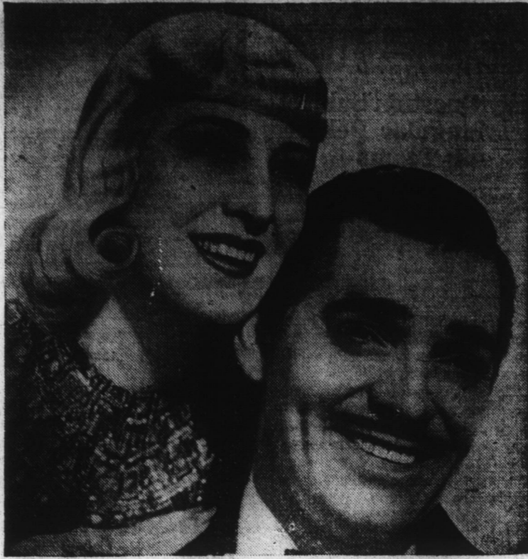
Norma Shearer as a vaudeville acrobat and Clark Gable as a "hooper" is the unusual and exciting dramatic fare offered to screen-goers in "Idiot's Delight" at Taylor Theatre, Edenton, Monday and Tuesday.