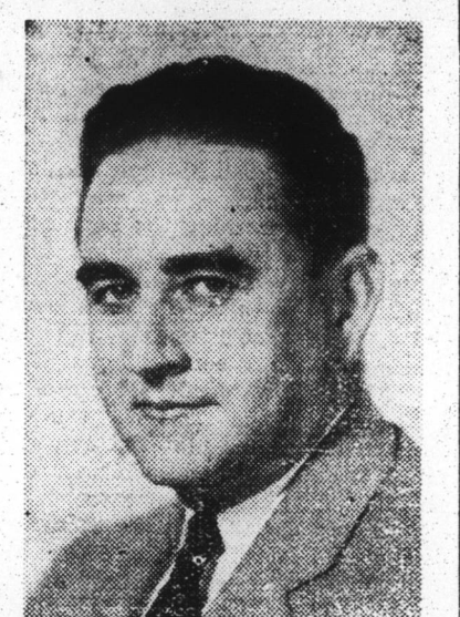
W. KERR SCOTT With about 50 Chowan County farmers as special guests of the Edenton Rotary Club in observance of Farmers' Night, Mr. Scott, commissioner of agriculture, will make the principal address at a meeting tonight in the Parish House.