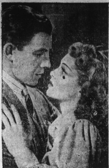
George Murphy and Lana Turner in "Two Girls On Broadway" at Taylor Theatre, Edenton, today (Thursday) only.