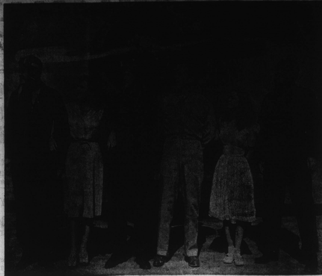
Wings against the sky fascinate the six above. They enact leading roles in "I Wanted Wings" at Taylor Theatre, Edenton, today (Thursday) and Friday. The air-minded sextette is (left to right) Ray Milland, Constance Moore, William Holden, Brian Donlevy, Veronica Lake and Wayne Morris. Produced with Army Air Corps cooperation, "I Wanted Wings" was filmed at Randolph and Kelly Fields in Texas and March Field in California, Flying Fortress roost.