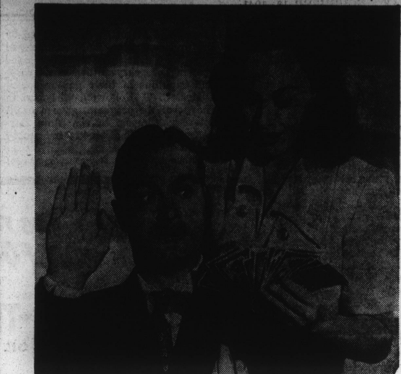
Money and honey—Bob Hope wins both in his zany role in "Nothing But the Truth," at Taylor Theatre, Edenton, today (Thursday) and Friday. That green, lettuce-y stuff is the money; the honey, of course, is beautiful Paulette Goddard, who co-stars in the new film.