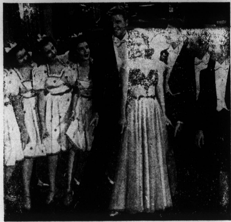
Phil Spitalny and his Hour of Charm All Girl Orchestra appear in a feature film for the first time in "When Johnny Comes Marching Home" at the Taylor Theatre, Edenton, today (Thursday) and Friday. Allan Jones, Jane Frazee, Gloria Jean and other favorites also star.