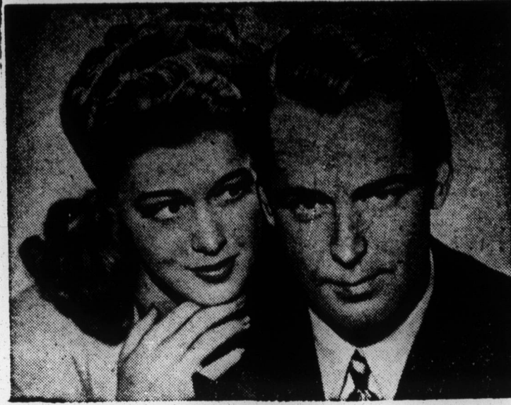
Tough Guy Alan Ladd is not only a two-gun man—he's a two woman man. In "Lucky Jordan," at Taylor Theatre, Edenton, Monday and Tuesday, he makes love to this blonde duet, Helen Walker and Marie McDonald.

Wife—I'm reading a mystery book. Husband—Why, that looks like our household budget. Wife—It is.