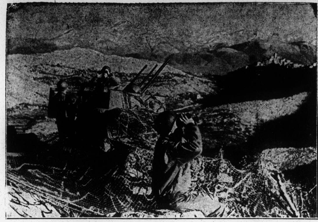
MOBILE AAC ARTILLERY IN ITALY-Partially hidden by a camouflage net, the business ends of three guns point skyward from this U. S. Army self-propelled half-track which is part of the equip ment of an anti-aircraft battalion on the Italian front. The scene is characteristic of the battle line in