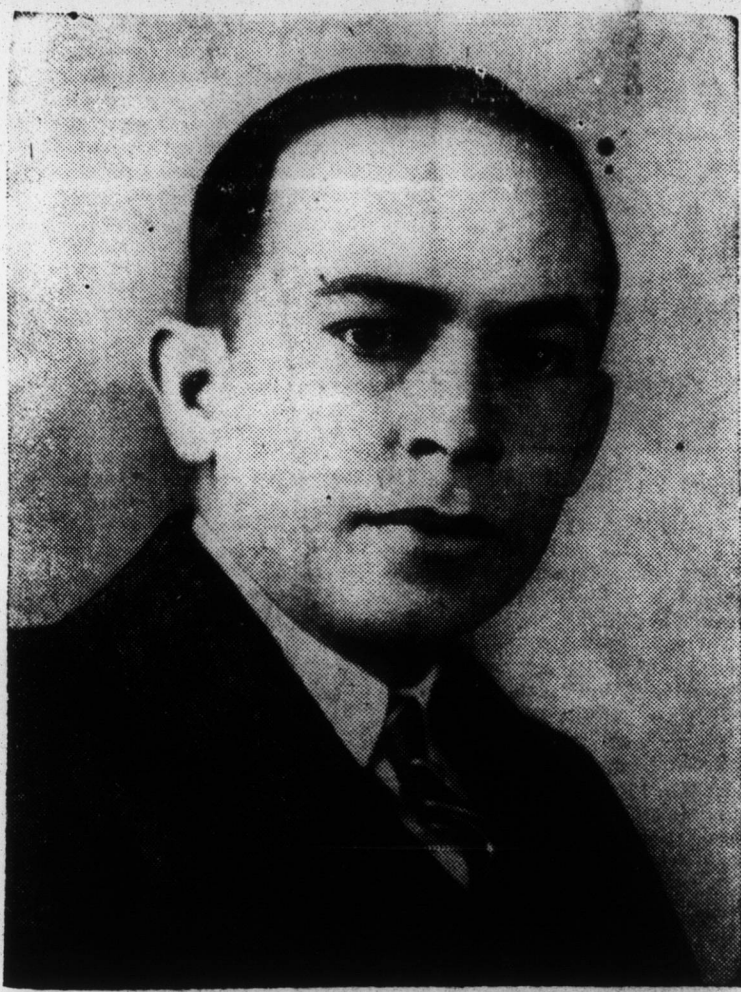
Congressman Herbert Bonner, now on vacation at his home in Washington, N. C., will visit in Edenton next Monday before returning to the national capital. While in Edenton he will attend the Lions Club meeting, at which Rotarians will also be special guests.