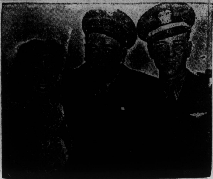
Wallace Beery is at his best in his new picture "This Man's Navy," at Taylor Theatre, Edenton, Monday and Tuesday. Tom Drake and lovely Jan Clayton play the romantic leads and the cast also includes James Gleason and Selena Royle.