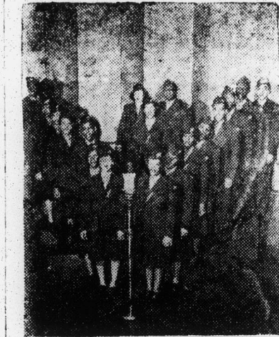
WINGS OVER JORDAN "OVERSEAS" CHOIR

What is said to be the world's greatest Negro choir will present "Wings Over Jordan" in the Kadesh A. M. E. Zion Church Wednesday night, May 1, at 8 o'clock. This is the eighth year of the chorus which has been heard by millions over the CBS coast-to-coast hookup on Sunday mornings, and a capacity crowd is expected to hear them when they appear in Edenton.