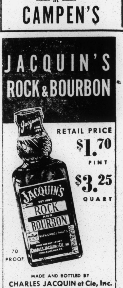
PHILA., PA. . EST. 1884